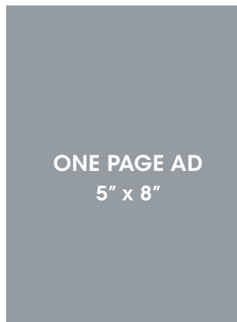
ONE PAGE AD 5" x 8"