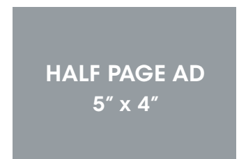
HALF PAGE AD 5" x 4"