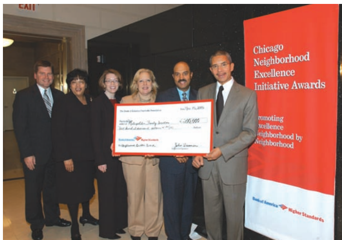
Officials from Bank of America, Metropolitan Family Services and Metropolitan's board of directors pose with a check from the Bank of America's Neighborhood Builders Award.

We would like to acknowledge our donors who consistently give so generously to Metropolitan's programs and initiatives. It is through the kindness of many generous individuals and organizations like these that we are able to continue our mission of building strong families and vibrant communities.