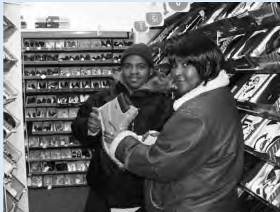
Sixty-four happy and grateful children received free shoes for the holidays from the Payless Gives Shoes 4 Kids program, courtesy of Payless ShoeSource.

Metropolitan's mission to help families reach their fullest potential positively impacts the communities in which they live. Whether it is providing premier child care services or helping families navigate needs for counseling, Metropolitan provides a wealth of programs and services designed to meet the needs of people of all ages.